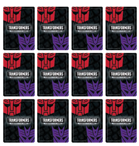
1-2 Plaver Matrix

1-2 Players: 3x4 (12 card Matrix) 3-4 Players: 4x4 (16 card Matrix) 5 Players: 4x5 (20 card Matrix)