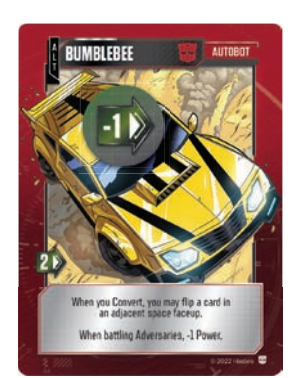
Ready, with 1 Move available.