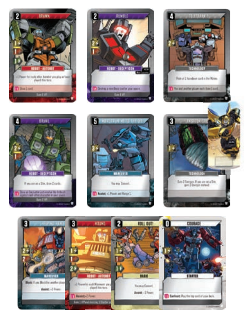
Example of Range

BATTLING A CARD: You can spend power to battle Adversaries in an attempt to defeat them. Battling is explaned in more deail on page 11.