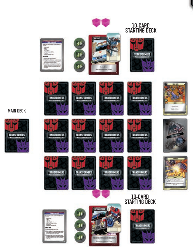
Example of 2-Player Game after Setup

Then determine the starting player: whoever most recently watched or read anything Transformers goes first, or you may choose at random. Now you are ready to play.